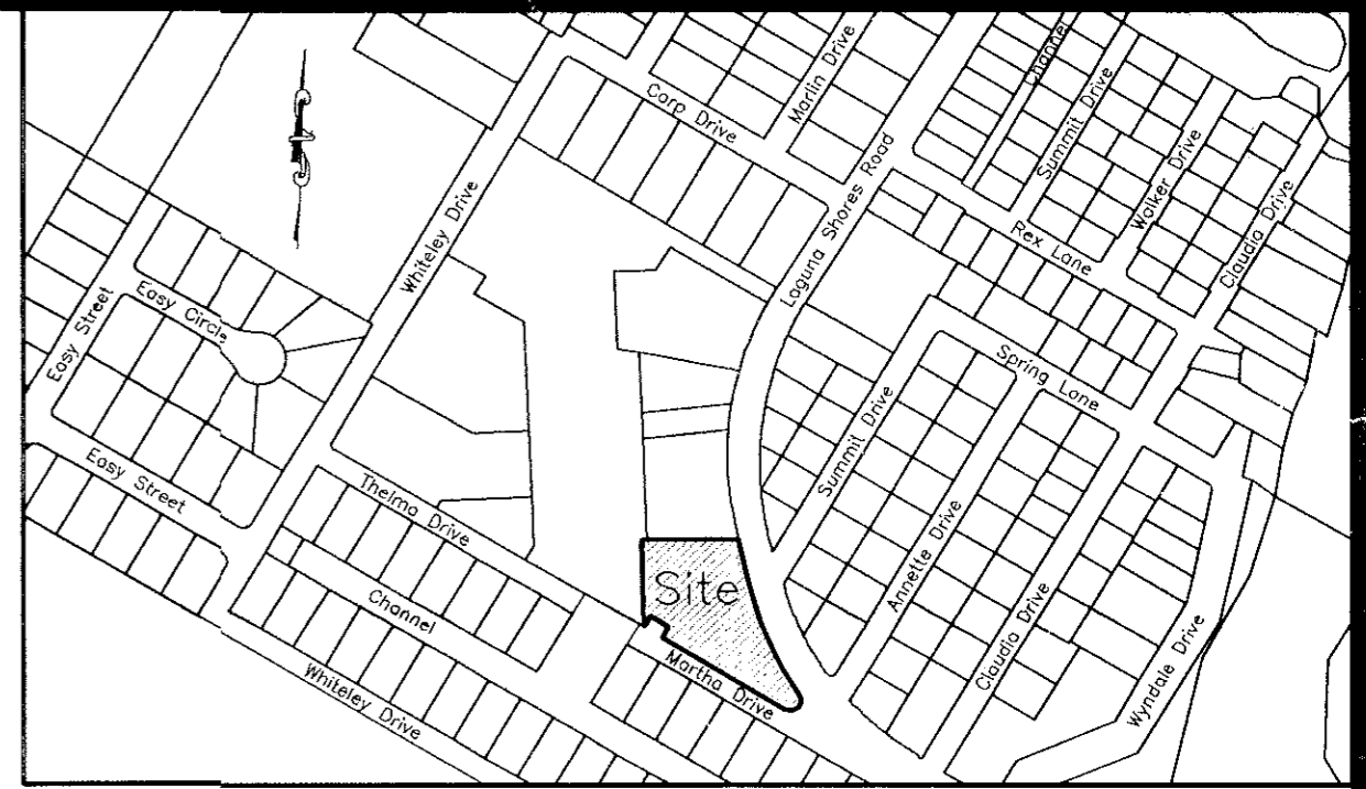
LOCATION MAP N.T.S.