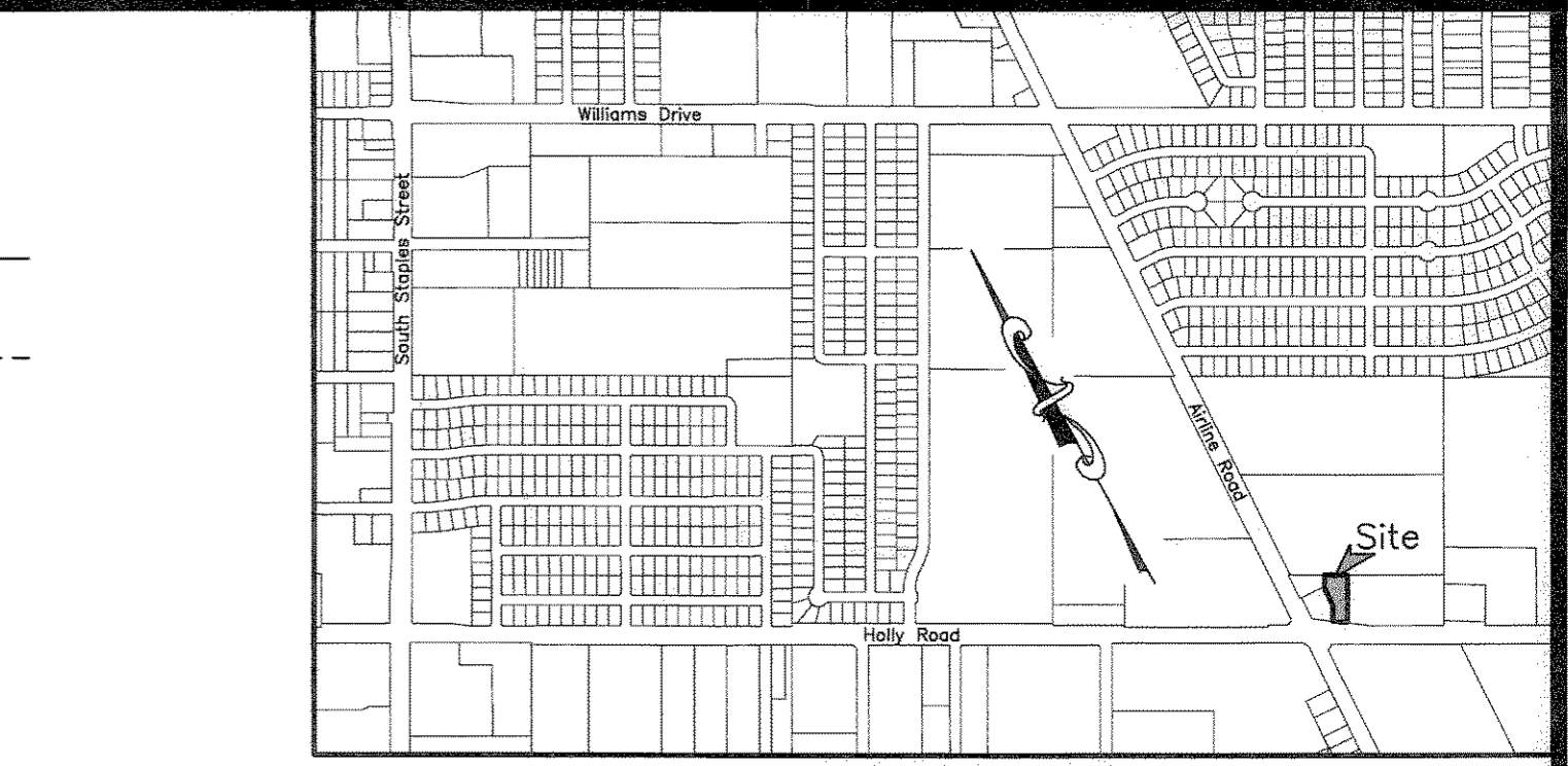
LOCATION MAP N.T.S.